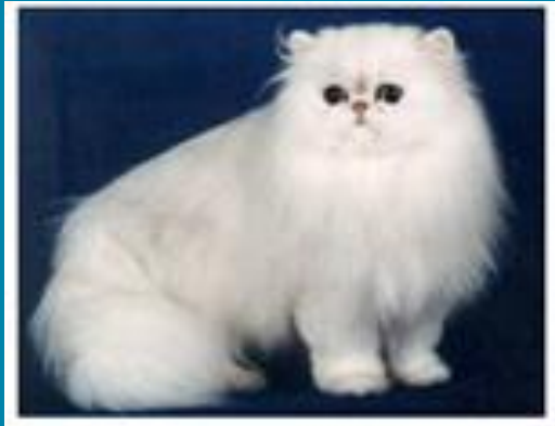
cat as filed (not accepted)