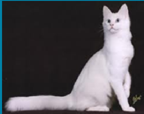
cat as granted